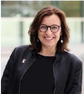
Tilly Metz